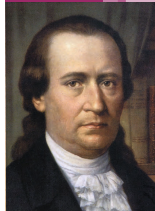
Dositej Obradović founding father of the University of Belgrade

The University’s main building, the Rectorate, was the endowment of one of the wealthiest Serbs of the time, Captain Miša Anastasijević, to his motherland. The building was built in 1863 and declared a Monument of Culture of Exceptional Importance in 1979. To this day it stands as one of the most beautiful buildings in Belgrade.